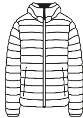
Packable & Light weight