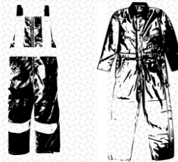
Coveralls & Bibs