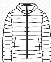
Packable & Light weight